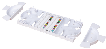
Fusion Splicing Kits (optional)

UltraX 1U enclosure is a rack mountable interconnect point specifically designed to manage dense fiber applications. This enclosure offers management of density up to 144 fibers. The detachable adapter plate on module cassette can be either installed independently and used along with fusion splicing kits. The detachable front cabling rack is designed with reliable hinge structure for friendly future maintenance.